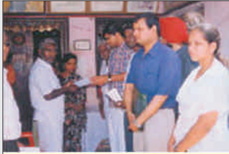
Distribution of Fixed Deposit Receipts by SASTRA on 25 th July 2004