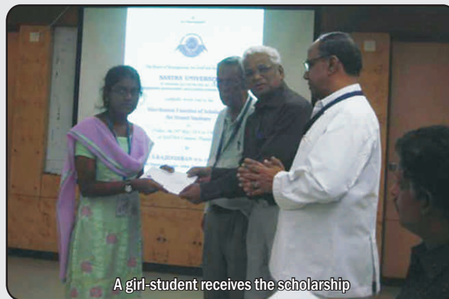
A girl-student receives the scholarship