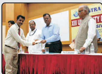
Cash award for Ph.D.