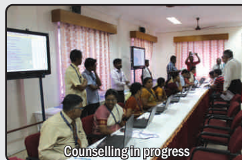
Counselling in progress