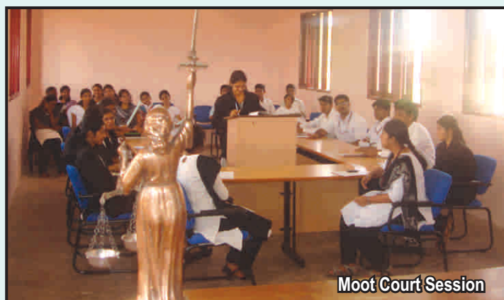
Moot Court Session

Appreciating the rich collection of books in the library, the Bar Council said: "The law library of the university has a rich collection of legal reference books, textbooks and online resources, and the Moot Court created in the School of Law facilitates experimental learning. The admission procedure is merit-based and transparent, and [the School] has attracted students from different parts of the country. The School's strong network with legal luminaries, Boards and Councils helps in periodic