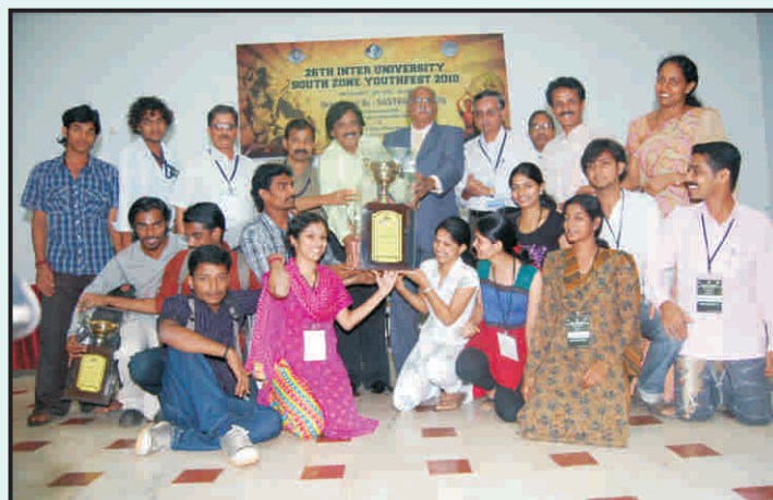
The winning teams & Team Managers of Mangalore University & S S University of Sanskrit, Kerala receive the Overall Championship Trophy