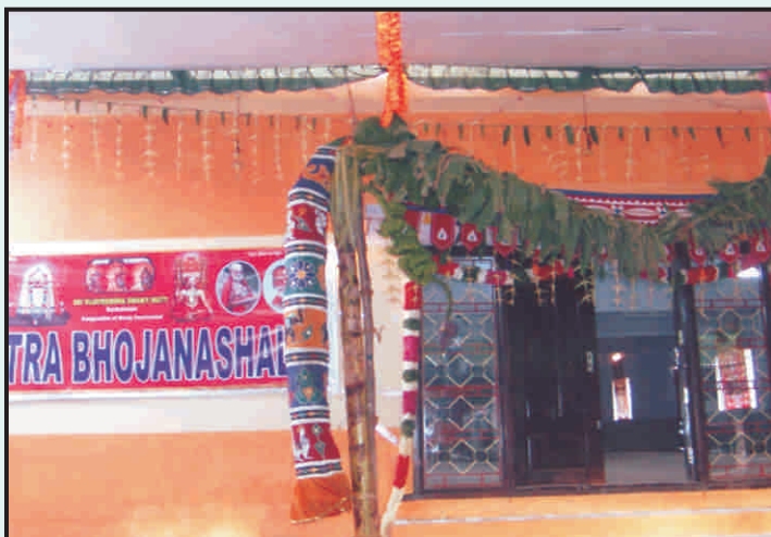
A view of the Bhojanashala

SASTRA University constructed a Bhojanashala, at a cost of Rs. 50 lakhs at Sri Vijayeendra Theertha Swamigal Mutt, Kumbakonam. The Bhojanashala was declared open by Shri M.N. Venkatachalaiah, Former Chief Justice of India on 10 th July 2010. Arrangements have been made to provide free meals to the devotees on all Thursdays and on Dwadhasi days.