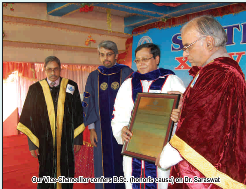
Our Vice-Chancellor confers D.Sc. (honoris causa) on Dr. Saraswat

Dr. V. K. Saraswat has contributed immensely as a technology and project leader to the development of Missile System. With a deep sense of appreciation for his devoted service to the country in various capacities and for his outstanding contributions to Indian Defence, his visionary approach, his leadership qualities and faith in a value-based approach to life and for his earnest endeavour to enthuse and ignite the scientific temper amongst the youth of the country, and by way of offering SASTRA's homage to a technocrat-intellectual, I have the honour to present unto you, Dr. Vijay Kumar Saraswat for the conferment of the Degree of Doctor of Science (honoris causa).