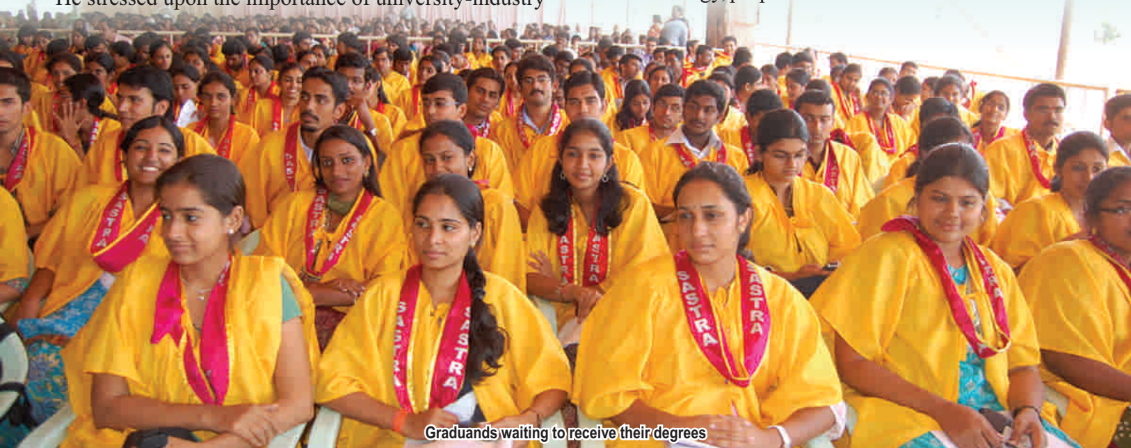
Graduands waiting to receive their degrees