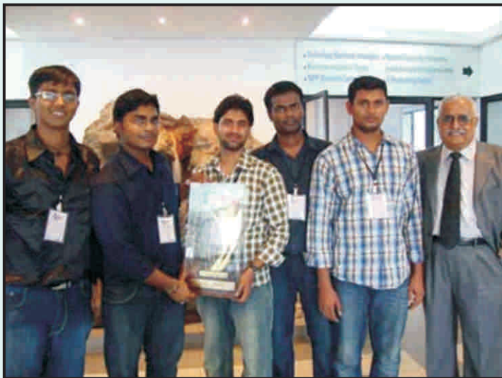
SASTRA team with the award