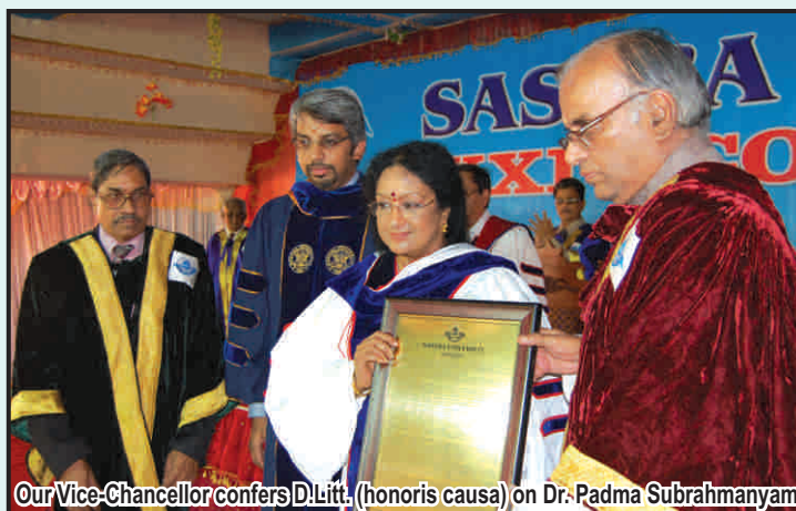
Our Vice-Chancellor confers D.Litt. (honoris causa) on Dr. Padma Subrahmanyam

A world renowned performer and authority on Bharatanatyam, Dr.Padma Subrahmanyam was the first to bridge the gap between theory and practice and revived an obsolete dance technique, translating theoretical concepts into practice. For five decades, she has been performing extensively in India and abroad. She was perhaps the first artiste who went and performed for our jawans in the forward areas in early sixties.