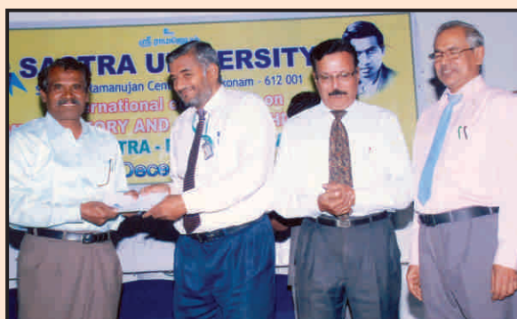
A school teacher receives a cheque for Rs.5000 towards library development