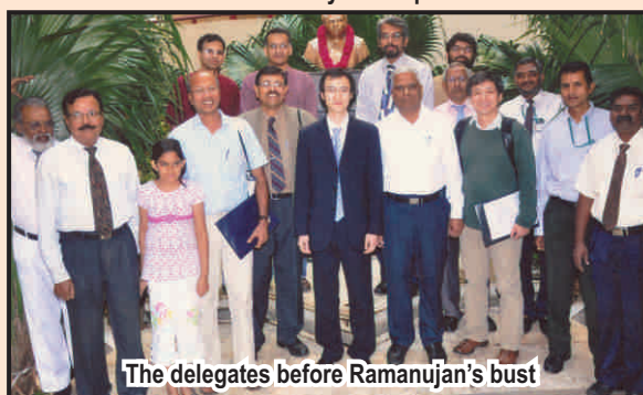
The delegates before Ramanujan's bust