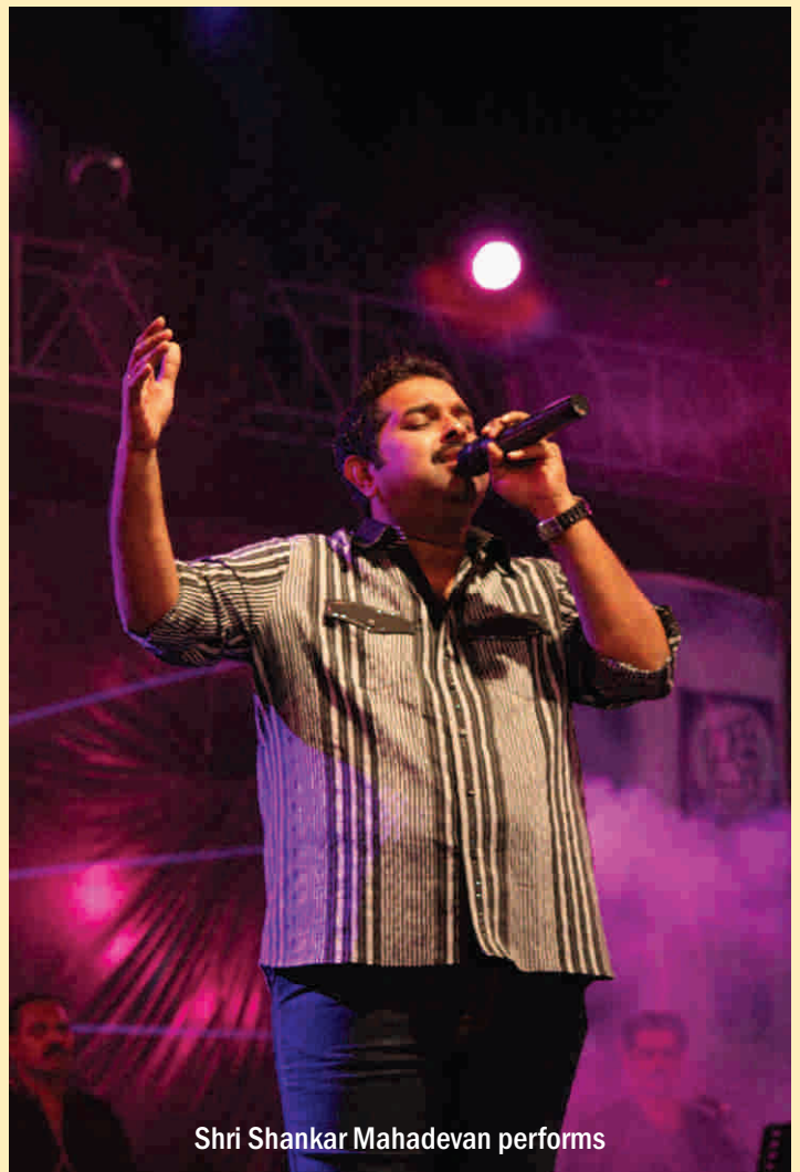
Shri Shankar Mahadevan performs