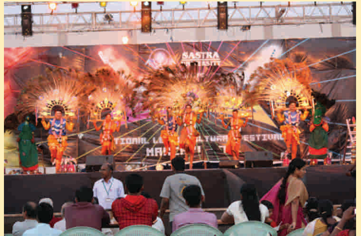
Kavadiattam, a traditional dance of Tamil Nadu