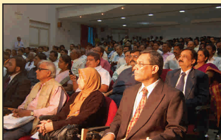
A section of the delegates

The PHYTOCONGRESS 2010 was attended by over 200 delegates and speakers from USA, UK, Australia, Malaysia and the Gulf countries besides Indian scientists, herbal manufacturers and practitioners.