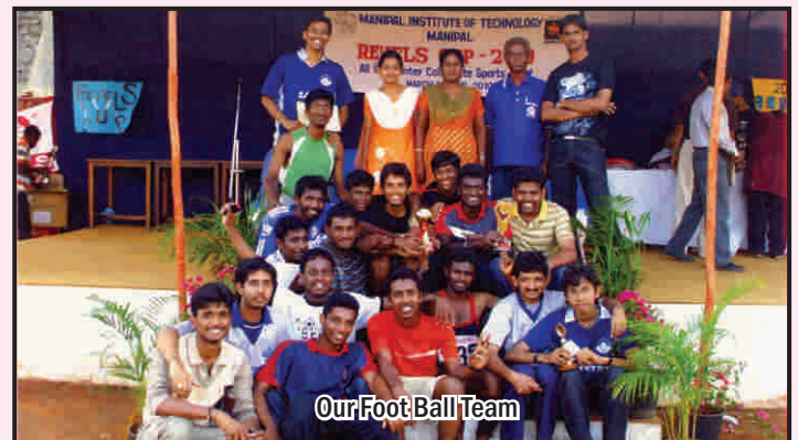
Our Football Team