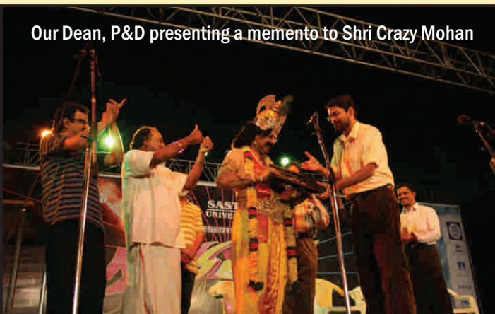
Our Dean, P&D presenting a memento to Shri Crazy Mohan

The evening air on March 5 was filled with laughter as Crazy Mohan and his troupe gave the audience a gastronomical exercise through his drama 'Chocolate Krishna'. At ease with the student audience, Shri Mohan and his team made the entire evening a