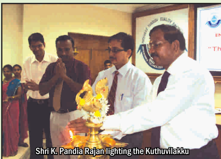
Shri K. Pandia Rajan lighting the Kuthuvilakku