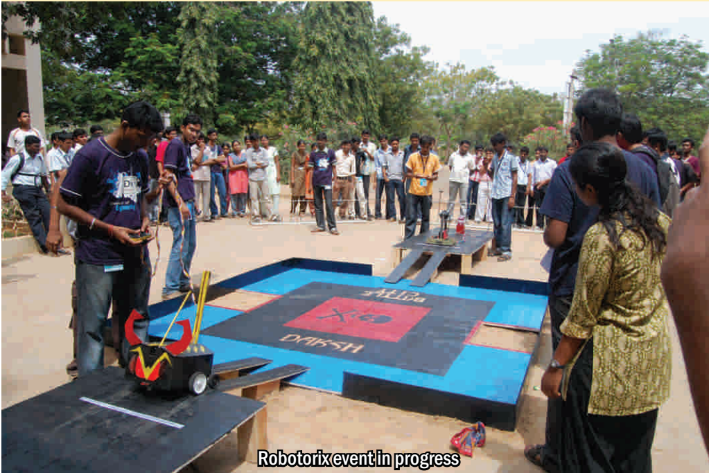
Robotix event in progress

In addition to this, events like the Wall Street Calling , NASDaksh , Dream Factory , Czar of the Bazaar , etc., put the management prowess of the students to a tough test.