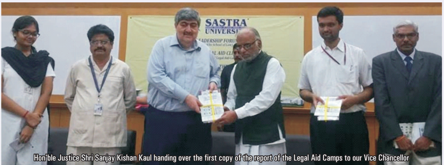
Hon'ble Justice Shri Sanjay Kishan Kaul handing over the first copy of the report of the Legal Aid Camps to our Vice Chancellor