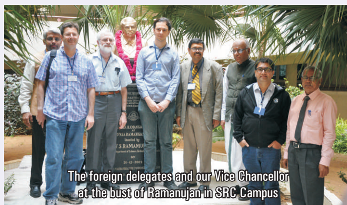
The foreign delegates and our Vice Chancellor at the bust of Ramanujan in SRC Campus

The SASTRA-Ramanujan Prize continues its great tradition of recognising the most exceptional work by young mathematicians.