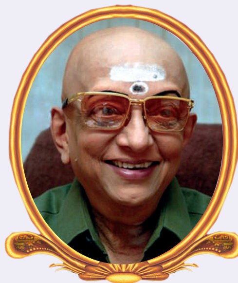
Shri Cho S. Ramaswamy 1934 – 2016

The objective of the creation of the chair is to conduct memorial lectures, discussions and research activities on public policy. Cho Ramaswamy was a combination of intellect and integrity, and as an immediate form of tribute SASTRA is creating the chair.