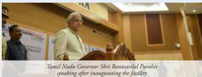
Tamil Nadu Governor Shri Banwarilal Purohit speaking after inaugurating the facility