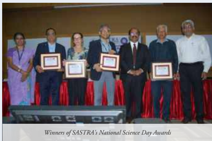
Winners of SASTRA's National Science Day Awards