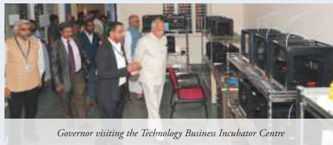
Governor visiting the Technology Business Incubator Centre

The IoT refers to billions of physical devices connected to the Internet, collecting and sharing data. IoT connects computing devices, mechanical and digital machines,